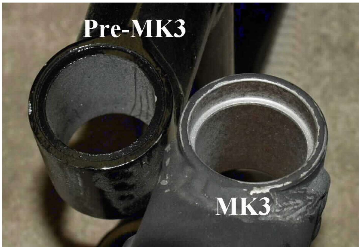
The Pre-MK3 swingarm bushing bore compared to the MK3 bore.

The MK3 bore diameter is 1.261" and .3" deep. Old Britts will provide this service (part number 38-600206) for X.XX as of 07/14/21; when purchasing our electric starter conversion kit. It takes us about one hour to setup the jig to hold the swingarm and about 1/2 hour for each end. The actual milling only takes a few minutes, but the setup is extensive.