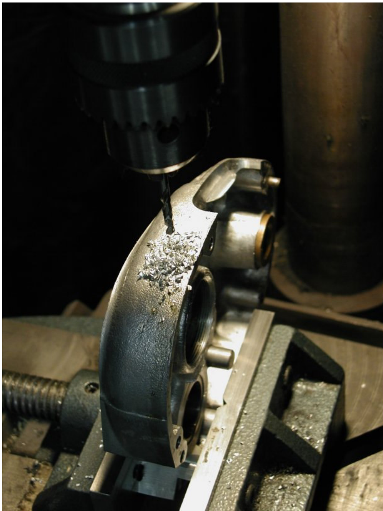
A picture of the breather hole drilled. Note: the angle of the hole is towards the center of the bearing.