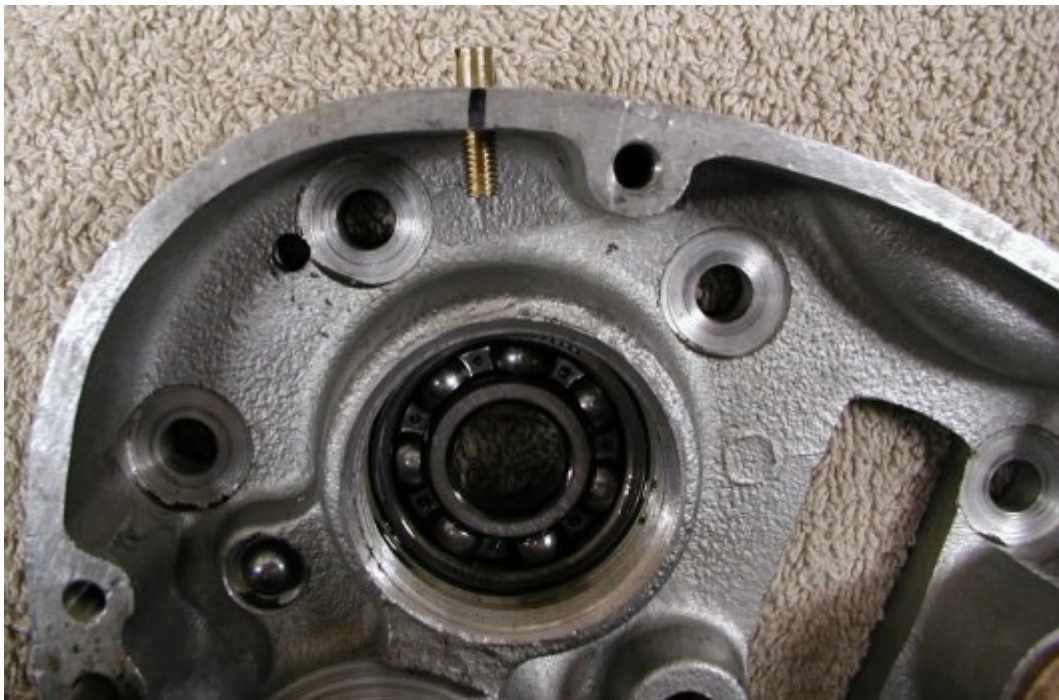
A picture of the breather installed on the inner gearbox case.

The best way to fix the pressure build-up is to install the MK3 breather vent (06-5199). This can easily be done with a #21 drill and a 10 x 32 tap. Drill a #21 hole, in the position shown in the next picture, .8" from the stud hole and 3/8" in from the edge. Tap this hole with a 10 x 32 tap and thread in the breather vent.